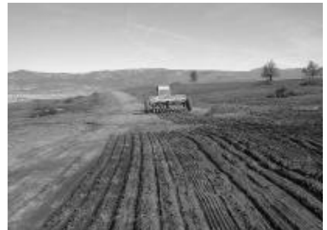
Drill seeding at LCCA

The preserve is currently closed to the public during re-seeding, but will be open to the public again in a limited fashion (outside of fencing enclosures), once the fencing is installed. LCCA is open to non-motorized use (equestrian, hiking, and bicycling) and is currently closed to all motorized use, hunting, use of firearms, and camping. LLTT will be leading a guided hike at the preserve in the spring/summer of 2008 to inform the public of our progress and goals.