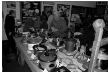
LLTT members enjoy soup & live music after the ski at the Susanville Depot