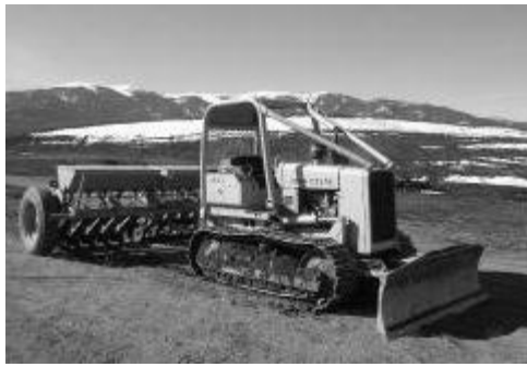
Tractor & seed drill at LCCA

Since the end of February, LLTT and partners have been working hard at re-seeding the LCCA that lost roughly 165 acres of mature bitterbrush & low sage that burned in the "Pine Fire" of 2007. Though fire is part of a natural cycle, many non-native plants can take advantage of the open space left from a fire in the early stages of recovery.