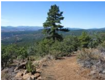
New Trail & Viewpoint looking West